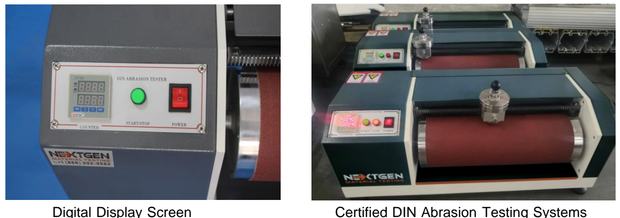
Certified DIN Abrasion Testing Systems

NORTH AMERICA (CORPORATE HEADQUARTERS): 170-422 Richards St., Vancouver, BC, V6B 2Z4 Canada CALIFORNIA: 3503 Jack Northrop Ave., Suite # AF937, Hawthorne, CA 90250 Toll Free:+1 (888) 332-3582 | Fax: +1 905 247-0555 | www.nextgentest.com