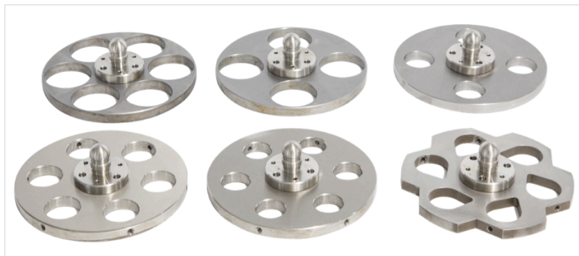
Specimen Sample Examples

Important Note: Sample Specimen Size to be indicated at time of order!