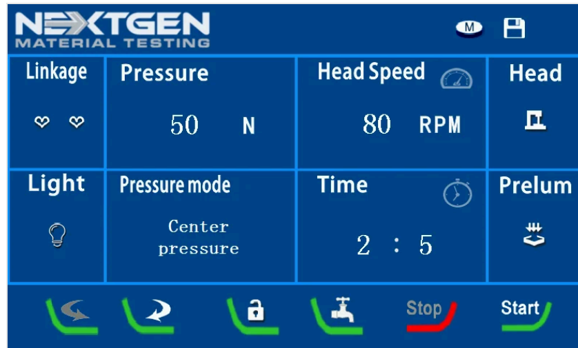
7" Touch Screen User Friendly Control Display

NORTH AMERICA (CORPORATE HEADQUARTERS): 170-422 Richards St., Vancouver, BC, V6B 2Z4 Canada